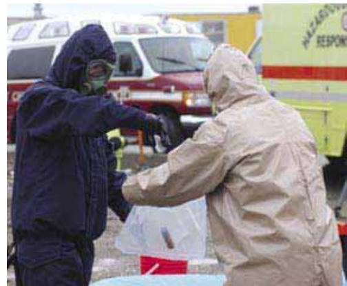
A publication produced by Safer Calgary in partnership with

uncertainty caused by disaster. It is important to know what to do before disaster strikes, as power and communication services are often disrupted, or overloaded in a disaster. You may not be able to call for help or access information when you need it most. The Red Cross and government websites have an abundance of information, checklists and procedures to follow in preparing for the possibility of disaster. These Web sites (see box) are easy to access, with printer friendly checklists and simple guidelines.