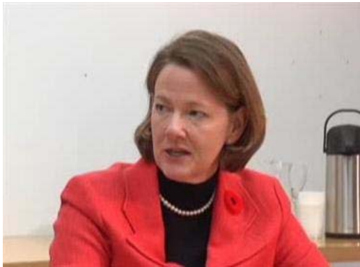
Premier Alison Redford disagrees with Calgary City Council's decision to ask Calgary Police to scale back their budget.

Be the first of your friends to recommend this.