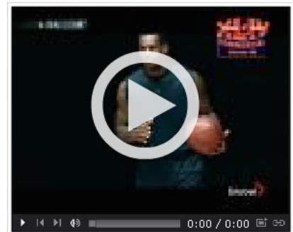
E-funnies - Feb 8 Superbowl Ads - Coke