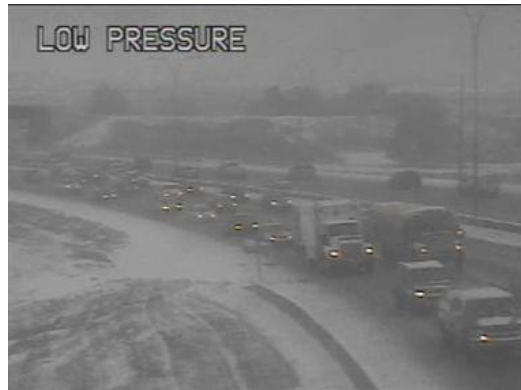
Deerfoot Trail at Calf Robe & Ogden Bridges